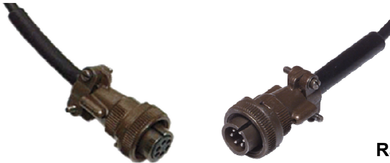
Model C3821-05 Radio Interface Cord Assembly

The C3821-05 Radio Interface Cable Assembly is designed to facilitate greater ease of installation of David Clark Series 3800 Vehicle Intercom Systems with a system design calling for more than two individual connections for radio interface. It is a turnkey assembly allowing direct connection between a Series 3800 Radio Interface Module and the U3805 Radio Junction Module, with no connector soldering required by the installer.